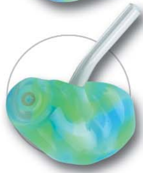
Blue and green Gel-E-Burst

Patients love them, and so will you. They're crafted to satisfy the most sensitive ear even when fitting a power BTE. Add a bright set of colors to your palette!